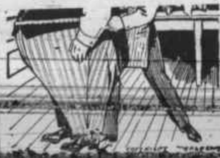
A Large Measure

of our success is due to the fitting of difficult forms and in filling the ballot box that says how the tax payers' money shall be spent!